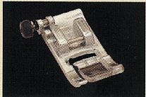
Standard Foot and

When sewing in the ditch, slightly pull the fabrics apart in front of the foot to give you a better view of the "ditch" to sew in. Keep the blade of the foot in the seam while sewing.