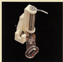
Free-motion Quilting Foot