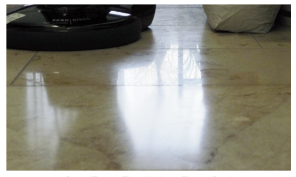
Step Two: The Yellow Floor Pad