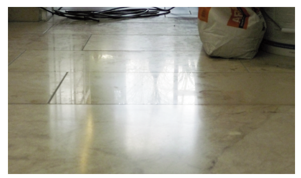
Step One: The Red Floor Pad