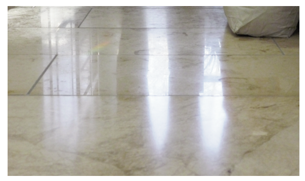
Step Three: The Green Floor Pad