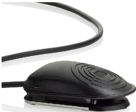
RELGVO28/71 Foot Pedal