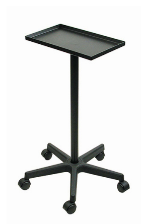
1400IA Boiler Stand