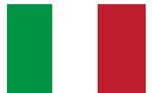
MADE IN ITALY