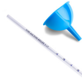
WHATS IN THE BOX