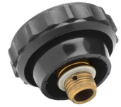
4 SAFETY SYSTEMS