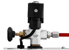
EXTERNAL SOLENOID WITH VARIABLE STEAM DIAL