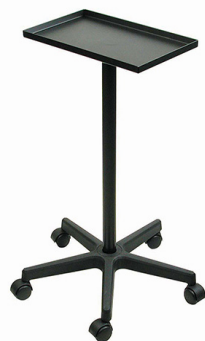
1400IA Boiler Stand