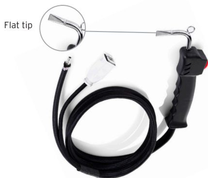
3000IA Steam gun with flat tip