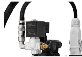
QUICK CONNECT FITTINGS WITH VARIABLE STEAM DIAL