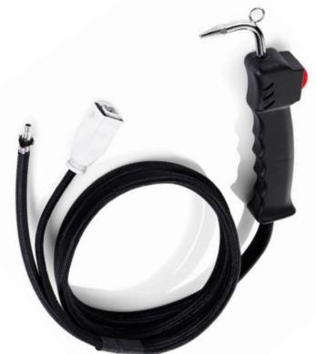
3000DA Steam gun