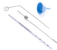
WHAT'S IN THE BOX