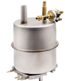
2.2L BOILER WITH EXTERNAL LONG LIFE ELEMENT