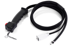
3000DA STEAM GUN WITH 6' STEAM HOSE