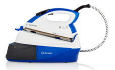
AUTO SHUT OFF