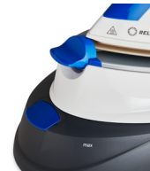
IRON LOCK FOR EASY CARRYING