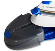
1L REMOVABLE WATER TANK