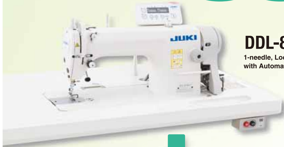
DDL-8700-7 1-needle, Lockstitch Machine with Automatic Thread Trimmer

The DDL-8700-7 is provided with the "new model control box" and the "new model compact servomotor," thereby substantially saving energy.