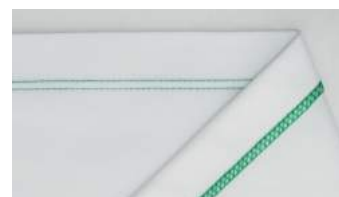
3-thread cover stitch (narrow)