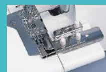
Hemmer guide (for cover stitch)