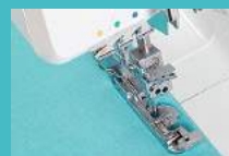
Chain stitch presser foot