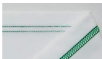
3-thread cover stitch (wide)