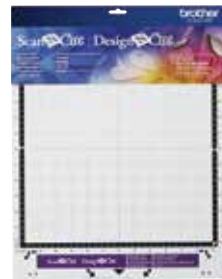
STANDARD MAT 12" X 12" CAMATSTD12

Specifically designed for a wide range of materials, from fabrics to handmade papers.