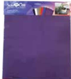
10 SHEETS CRAFT VINYL: ASSORTED COLORS CAVINYLMP

12" x 12" sheets (10 pieces), Thickness: 3.0 mil