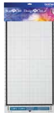
LOW TACK ADHESIVE MAT 12" X 24" CAMATLOW24

Specifically designed for delicate paper like copy paper, vellum and thin scrapbook paper as well.