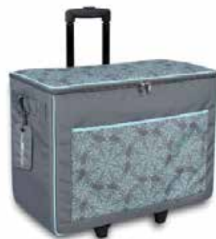
SCANNCUT DX ROLLING TOTE BAG - GRAY CADXTOTEG

Designed specifically to fit the ScanNCut DX machine, mats, and other accessories.