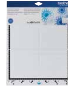
LOW TACK ADHESIVE MAT 12" X 12" CADXMATLOW12

For use with Brother ScanNCut machines. Not compatible with ScanNCut DX machines. See ScanNCut DX mats.