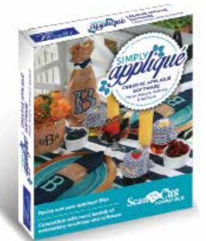
SIMPLY APPLIQUÉ SABESSA

Make superb custom appliqué from a huge selection of exceptional designs and creative options. You will love the way Simply Appliqué fully integrates with ScanNCut Home and Hobby Cutting Machines so you can easily cut out your appliqué with ultimate precision.