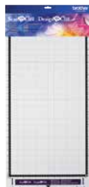
STANDARD MAT 12" X 24" CAMATSTD24

Specifically designed for a wide range of materials from fabrics to handmade papers.