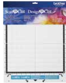
LOW TACK ADHESIVE MAT 12" X 12" CAMATLOW12

These mats have tacky adhesive to secure material for cutting and can be used numerous times. Not compatible with ScanNCut DX machines, see ScanNCut DX mats.