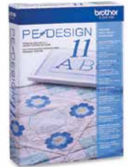
PE DESIGN 11 PEDESIGN11

BES 4 Dream Edition is a full-featured desktop lettering, monogramming, and customization PC software that opens your world of creativity with fonts, designs, and editing features. It also includes a wireless upgrade kit for many Brother machines as well as file storage and basic editing capability through the free access you receive to BES Cloud. BES 4 is completely compatible with the ScanNCut Home and Hobby Cutting Machines. Simply import and export ScanNCut FCM files to create appliqué.