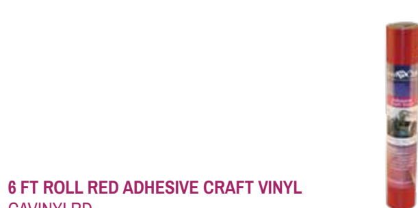
6 FT ROLL RED ADHESIVE CRAFT VINYL CAVINYLRD