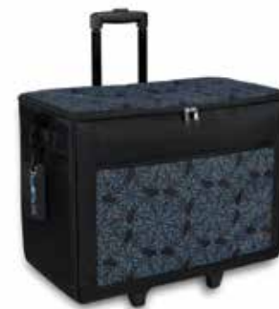
SCANNCUT DX ROLLING TOTE BAG - GRAY CADXTOTEG