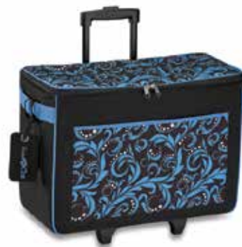
SCANNCUT TOTE BAG - BLUE CATOTEB

Designed specifically to fit the ScanNCut machine, mats, and other accessories.