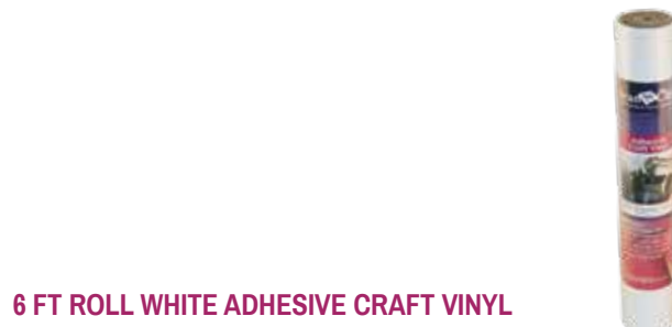
6 FT ROLL WHITE ADHESIVE CRAFT VINYL CAVINYLWT