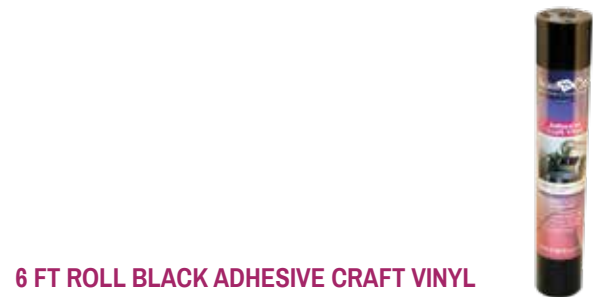
6 FT ROLL BLACK ADHESIVE CRAFT VINYL CAVINYLBK

This adhesive craft vinyl is removable on most nonporous surfaces. Adhere to glass, plastic, metal, walls, and virtually any nonporous surface with ease. Use the gridded transfer paper for application (sold separately).