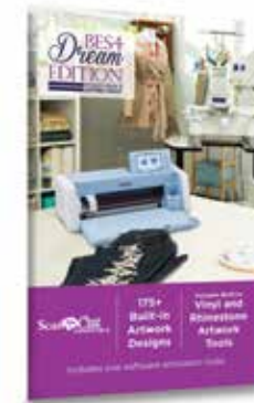
BES 4 DREAM EDITION POWER PACK 2 SABES4UG2

The Cutting Tools Power Pack 2 Add-On provides timesaving electronic cutting machine features for your BES 4 desktop software. Enjoy advanced digital cutting tools at your fingertips, create beautiful rhinestone designs, adhesive vinyl designs, and heat-transfer vinyl designs. Even create your art from scratch or modify existing artwork files. Add artwork transformation tools such as Weld, Combine, and Knockout, while the Layering Alignment tool adds alignment marks to assist in aligning multi-layer vinyl designs. Also create digital cutting machine files. Arrange cutting files on paths, circles, corners, or create circle text, spiral text, monogram text, plus more.