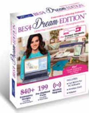
BES 4 DREAM EDITION BES4

BES 4 Dream Edition is a full-featured desktop lettering, monogramming, and customization PC software that opens your world of creativity with fonts, designs, and editing features. It also includes a wireless upgrade kit for many Brother machines as well as file storage and basic editing capability through the free access you receive to BES Cloud. BES 4 is completely compatible with the ScanNCut Home and Hobby Cutting Machines. Simply import and export ScanNCut FCM files to create appliqué.