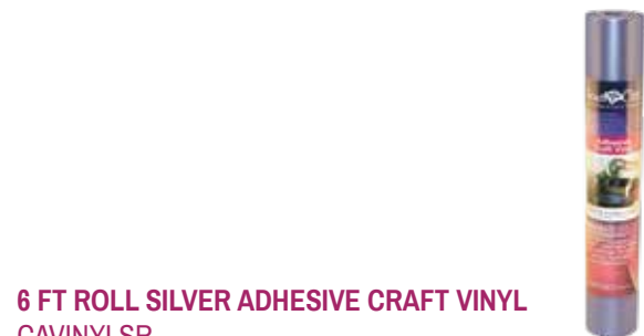
6 FT ROLL SILVER ADHESIVE CRAFT VINYL CAVINYLSR