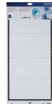
LOW TACK ADHESIVE MAT 12" X 24" CADXMATLOW24

For use with Brother ScanNCut machines. Not compatible with ScanNCut DX machines. See ScanNCut DX mats.