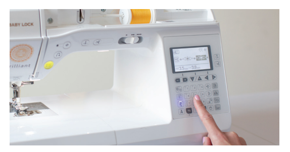
Programmable Stitch Functions - Create your own one-ofa-kind pattern by combining decorative stitches and then save them in Brilliant's built-in memory!