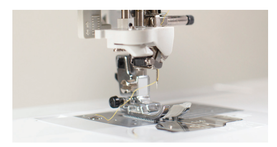
Advanced Needle Threader - With just a few simple motions, your needle is threaded and ready to use. There's no guesswork, no near-misses and no frustration!