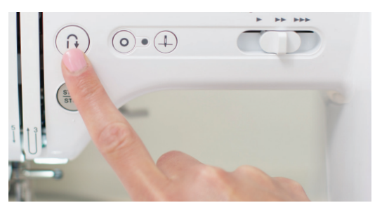
Push Button Features - Start and stop sewing, position the needle up or down, cut your thread and reverse sew – all with just the push of a button.