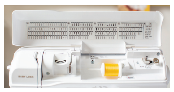
190 Stitches Including 10 One-Step Buttonhole Styles - Add your unique touch to every project with a library of stitches that sets everything apart!