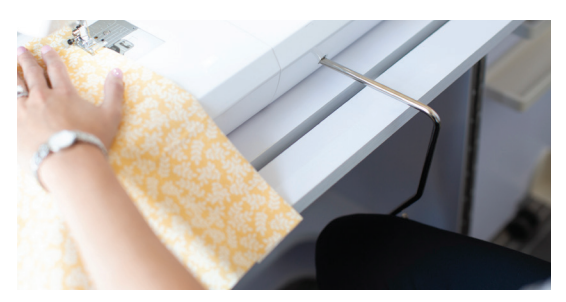
Hands-Free Knee Lift - Eliminate errors with the detachable knee lift that raises the presser foot with a tap of the knee, leaving both hands free to sew.