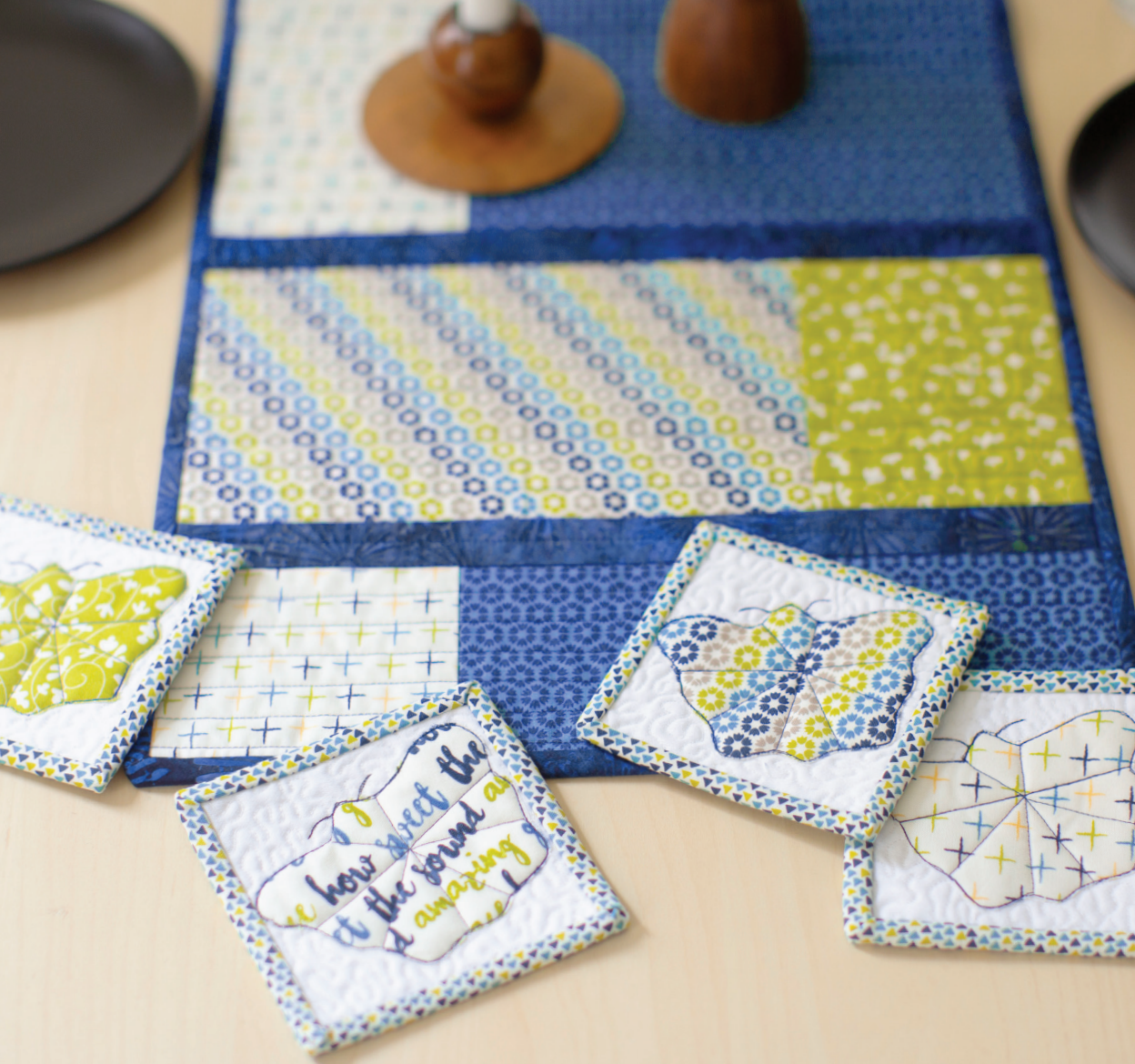
Diane Kron • "Table Tranquility"