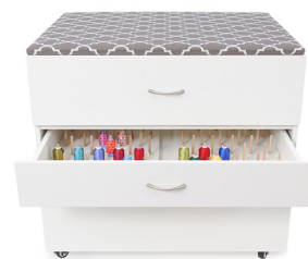
MOD Embroidery Storage Cabinet

Every dream sewing oasis needs its cute, dependable accessories! Add even more convenience with MOD Embroidery Storage Cabinet - featuring dedicated storage for your embroidery machine, a built-in ironing board and expansive thread drawers! Your dream sewing space won't be the same without it!