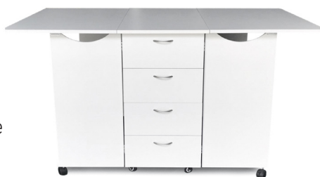
Kookaburra Cutting Table

Americana sewing cabinet - check! Now complete your studio with Kangaroo storage and cutting furniture, specially designed to complement your primary workstation. With extra storage and workspace, you can customize your sewing room to be stylish, comfortable, and even more productive!