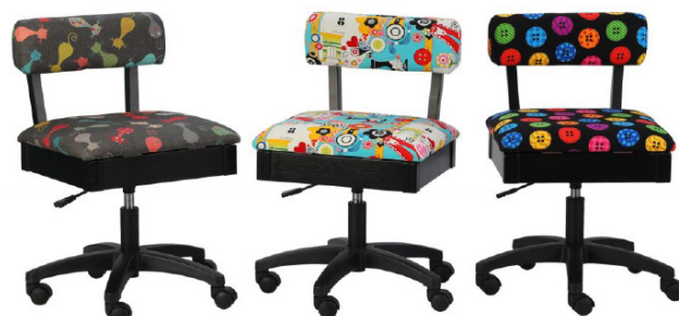
Cat's Meow, Sew Wow Sew Now & Bright Buttons Chairs

The cherry on top of your sewing sundae! Arrow's #1 Rated Height Adjustable Sewing Chair is a must have accessory for your dream sewing room! Cute, comfortable and convenient - our lovable chairs feature vibrant sewing themed patterns, 360° swivel access and lumbar support for long hours at your workstation. Don't look now, but under every seat cushion is a hidden storage compartment to store your notions and patterns! Available in 10 colors to perfectly match your sewing sanctuary!