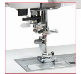
Superior Needle Threader & Improved Sewing Field View