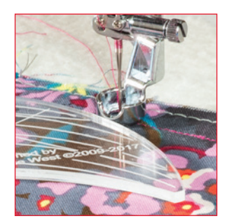
Ruler Quilting Function