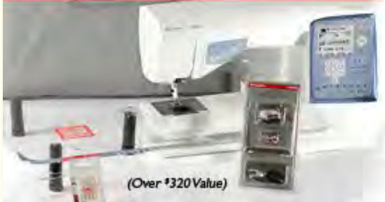
(Over $320 Value)