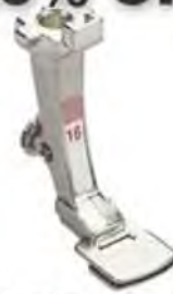
Gathering Foot #16

Gathering is easy with the right presser foot