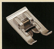
Monogram Foot or Free-motion Quilting Foot and Alternate Bobbin Case